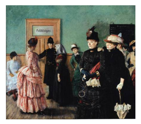
Albertine i politilægens venteværelse (Albertine at the Police Doctor's Waiting Room, 1885–87)

There are notable collections of art by Christian Krohg in the National Museum of Art, Architecture and Design in Oslo and at Skagens Museum in Denmark.